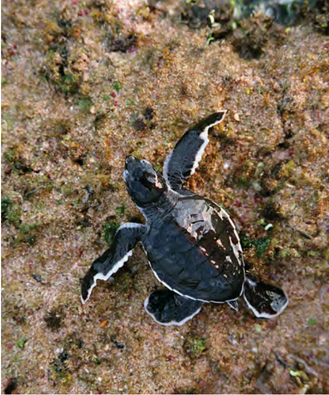
Left: More than 20,000 green turtles nest on Barrow Island, with females laying around five clutches of 100 eggs each season.