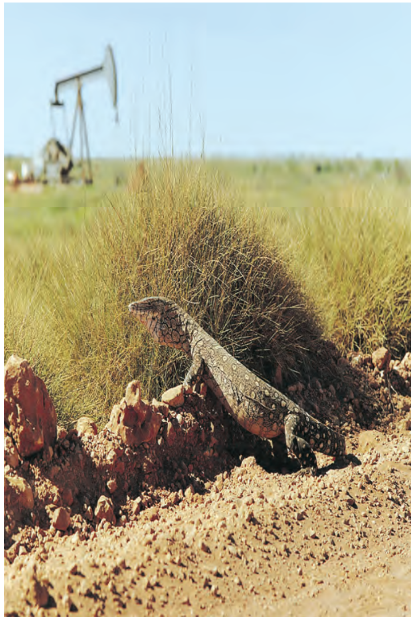
Above: Up to 6.6 feet (2 m) long, the perentie is Australia's largest lizard. Unique spot patterns mean each animal can be recognized individually.

Thirteen pathways have been identified by which nonindigenous species might enter the island, including food, luggage, marine vessels and helicopter transfers, to name a few. These pathways are part of the QMS protocol of interventions that span preborder (before goods and personnel reach the island), border (on arrival) and postborder (outside the development site).